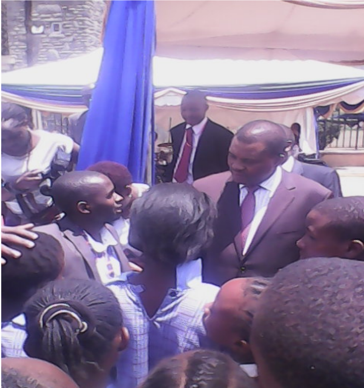
{With me on the right is the Speaker of the National Assembly HON. JB Muturi as I introduce the

MOTTO: {Brace yourself like a man; I will question you, and you shall answer me. Job 38:3}