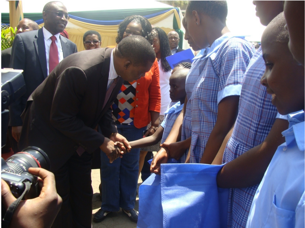
{The speaker of National Assembly (HON. JB Muturi) shares a moment with KE590 CDC children leadership parliament when the team visited the parliament of Kenya}.

We normally organize trips to the National assembly and house of the senate so as to connect the children leadership parliament of Kenya with the main aim of having one on one talk with the speakers of National assembly and the Upper Chamber , senators and MPs .To listen to them as they listen to us.