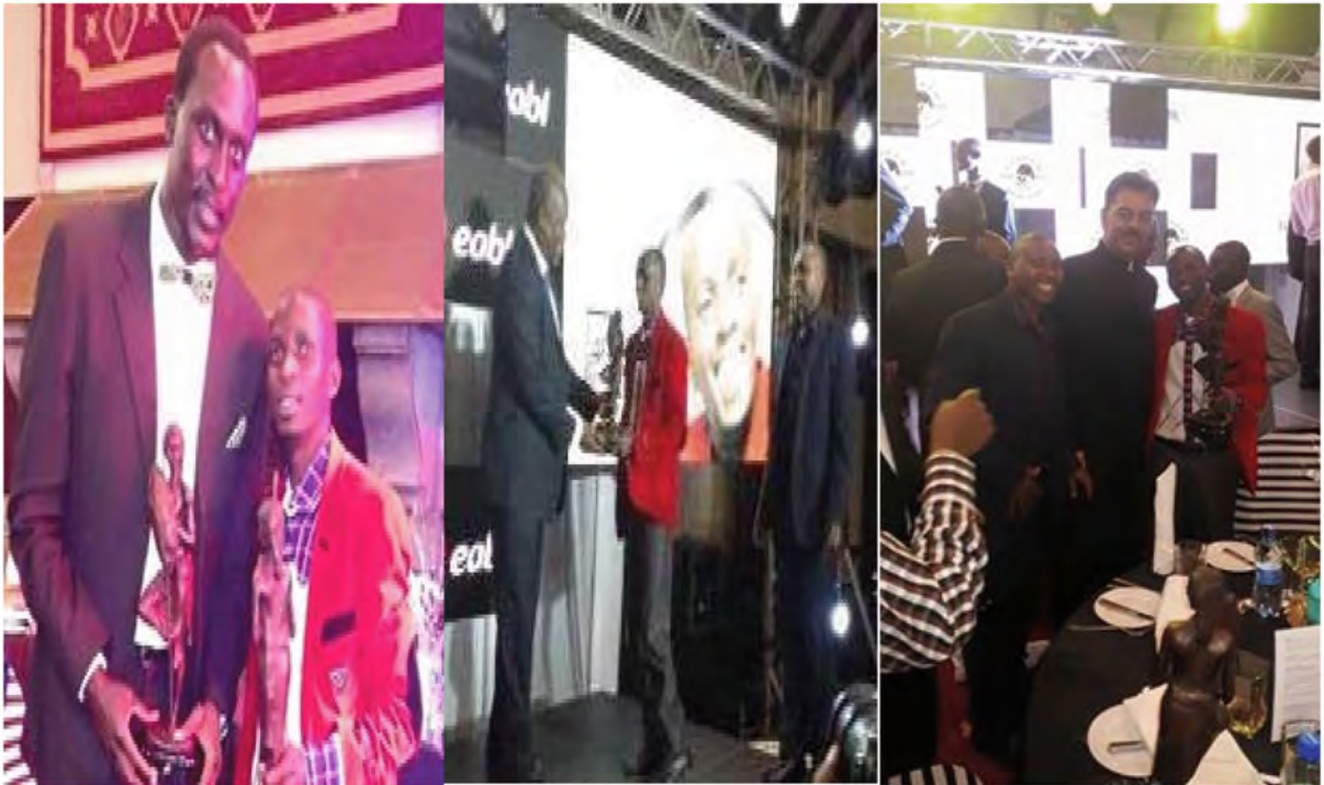
With kenya lagbay champion, bidco company CEO and national media group CEO receiving awards for top 40 under 40 men kenya leadership award of the year.