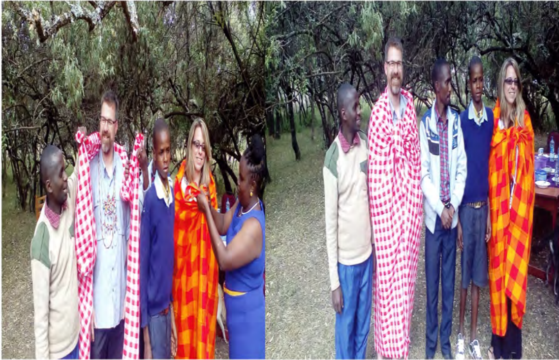
(DURING SPONSOR VISIT By Julie Jones USA )