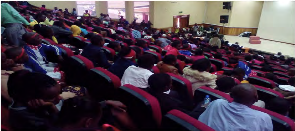
(CONDUCTING ADOLESCENT TRAINING CAMP AT ST.PAULS UNIVERSITY)