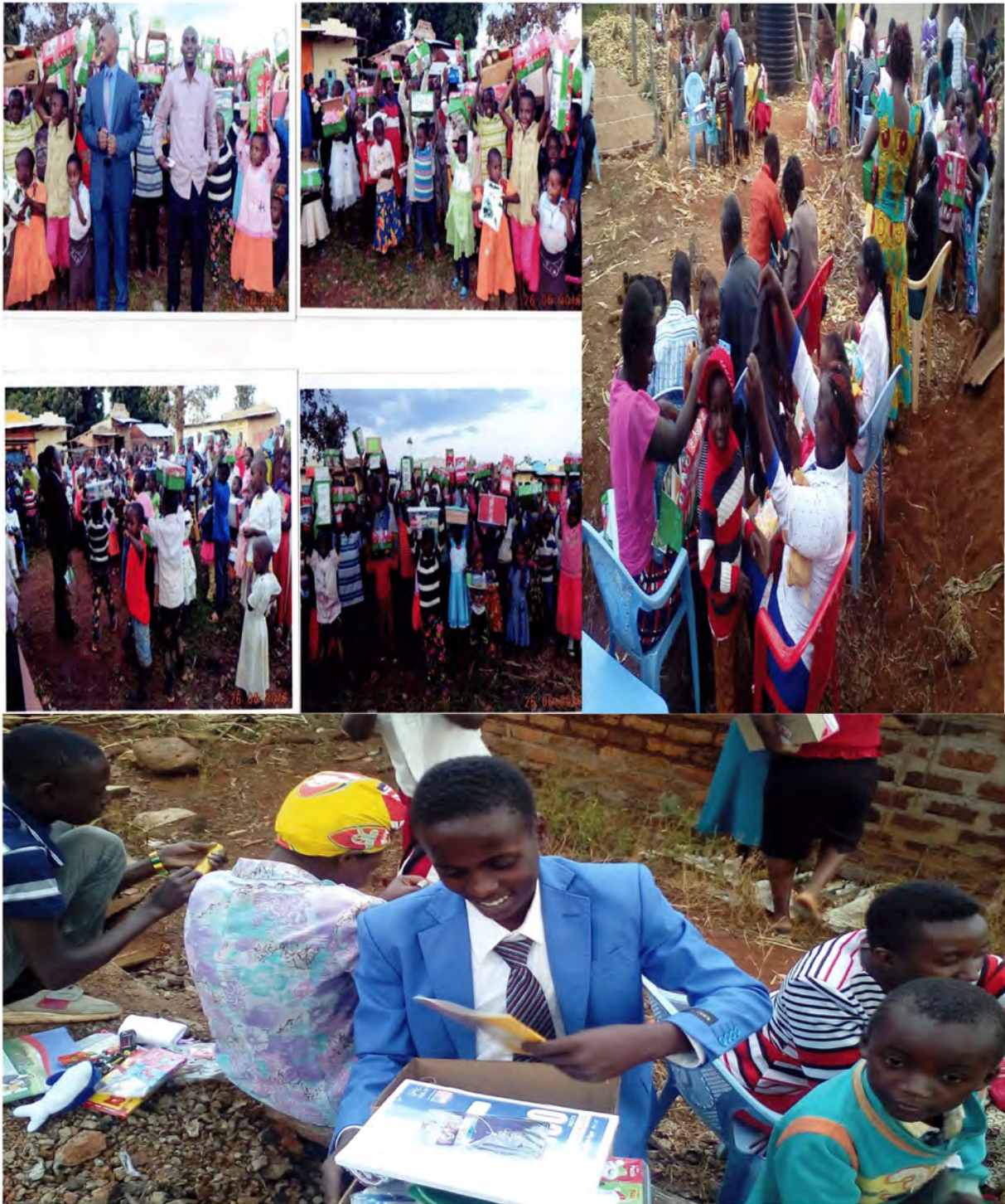
(Above photo: Giving Christmas gifts to our sponsored children)