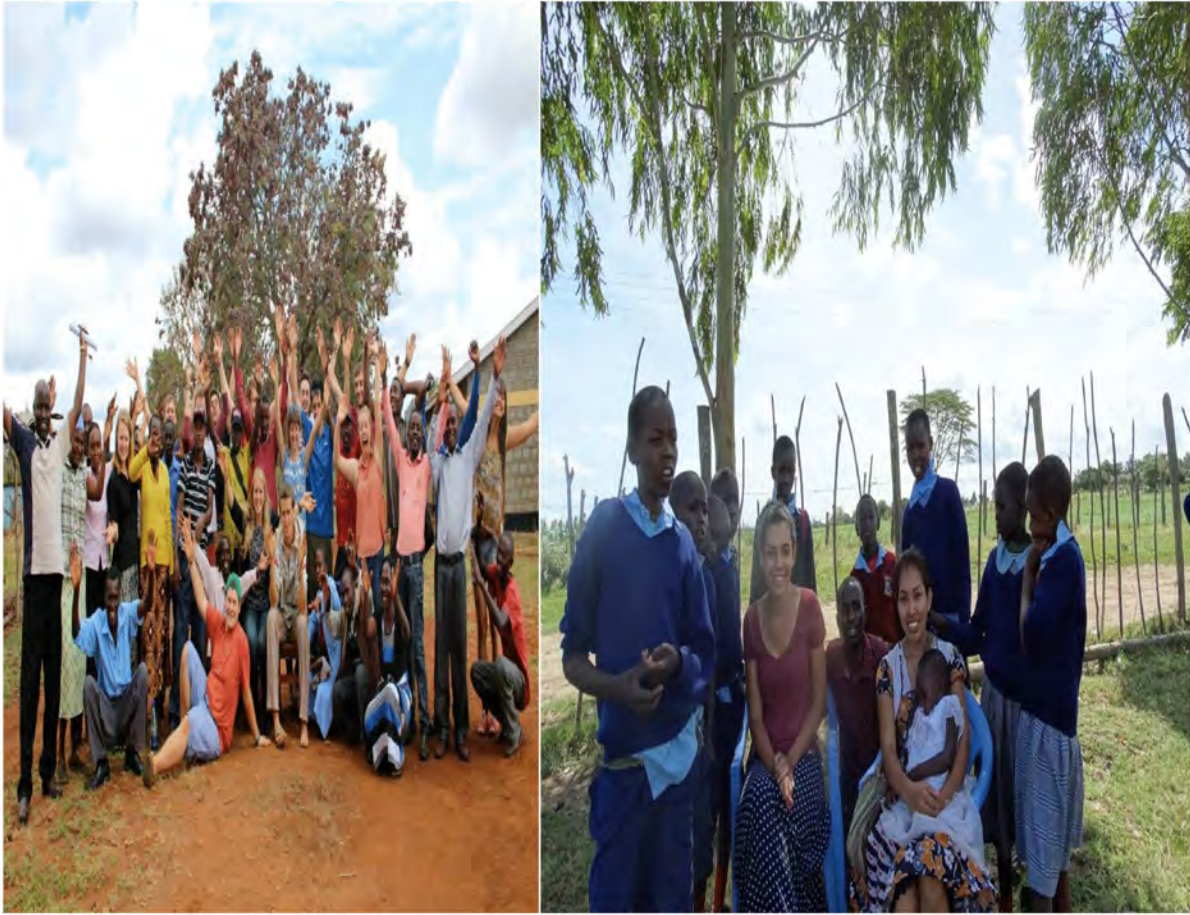
(GLOBAL COMMUNITY DEVELOPMENT VOLUNTEER EXCHANGE PROGRAM WITH STUDENTS FROM OVERSEAS AND KENYAN UNIVERSITIES)