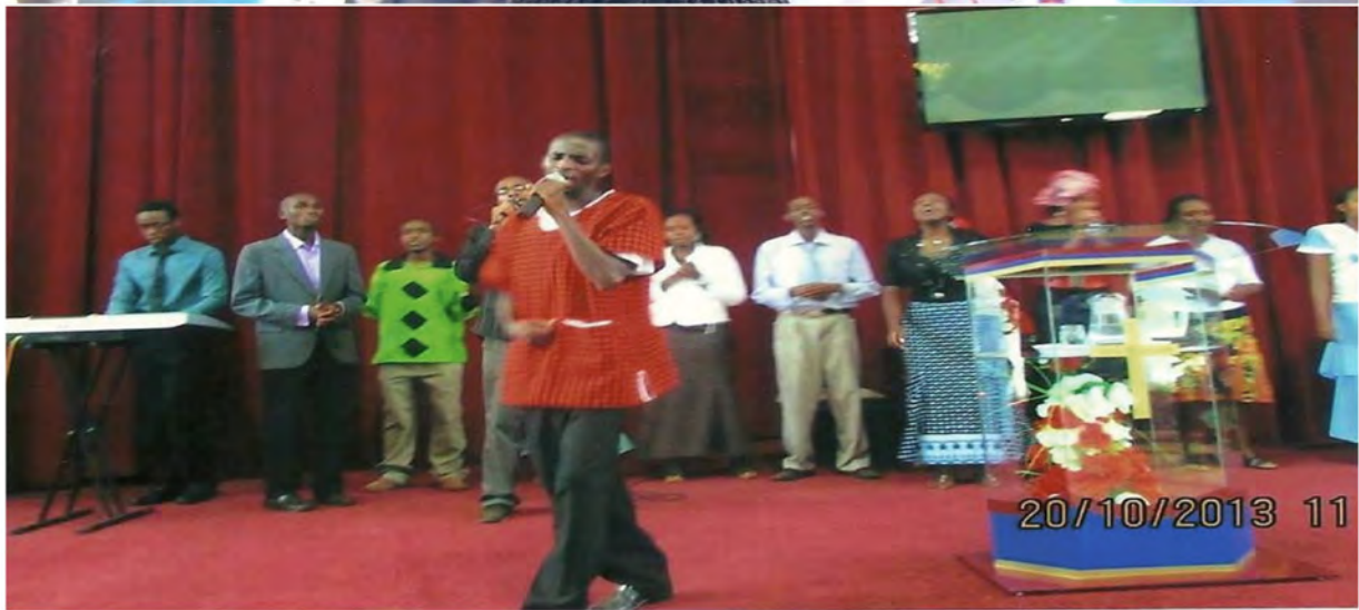
(Mission outreach and conference in Kenya)